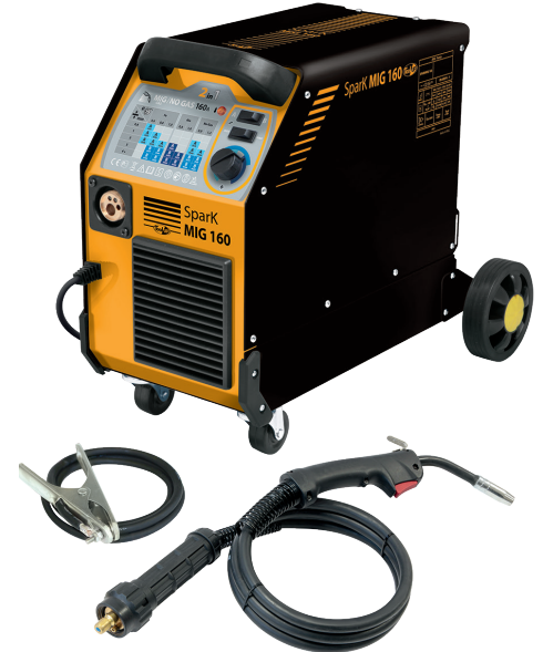
Earth Clamp and 2.2m EURO torch included.

Constant running fan protects unit against overheating.