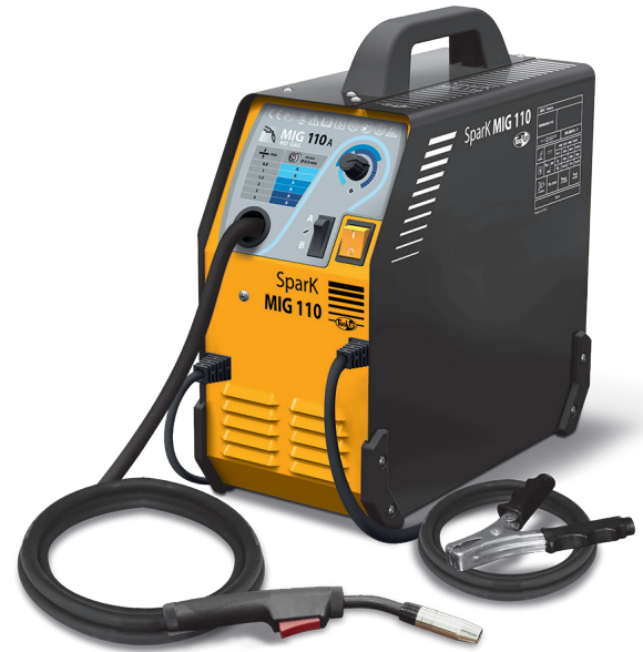
Supplied with an earth cable and a 2.2m fix torch.